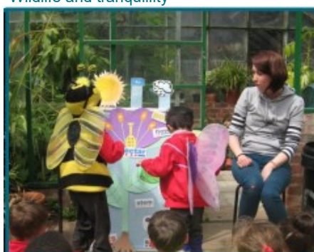
Environmental Education Programme

In 2019-2020, we celebrated 23 years of community gardening; extended the Courtyard Garden with support from Jo Malone London; introduced a programme for people living with dementia and, in June 2020, received the Queen's Award for Voluntary Service. As a long- established Community Garden we are often called on for advice on running Therapeutic Horticulture in a Community Garden setting. We are the only Community Garden in Birmingham to have been awarded Keep Britain Tidy's Green Flag award, 12 years running.