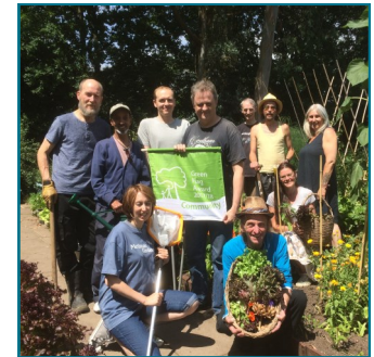
Staff & volunteers celebrate winning the Green Flag Award, surrounded by seasonal produce.

Martineau Gardens is a beautiful Community Garden on Priory Road in Edgbaston. An oasis for wildlife, a haven of tranquillity and a great place to visit. There are two and a half acres of organically managed landscape for visitors to explore, including woodland with SLINC status (Site of Local Importance to Nature Conservation), wildflower meadow, demonstration food growing areas, plant sales, bird hide, bee hives, formal gardens with shrubs and trees from around the world and a children's play area. We grow and sell vegetables, fruit and plants. The gardens and buildings can be hired for meetings and celebrations.