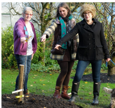
The new tree is planted

"It was my mother's wish that I plant a 'Doddin Tree' for her after she had died. 'Doddin' is a rare, small tree, from Redditch, the apples are the size of a elongated golf ball and very sweet. Apparently you can eat everything yes, including the core.