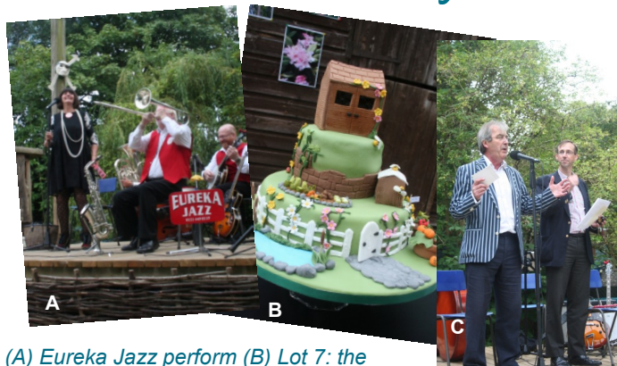
(A) Eureka Jazz perform (B) Lot 7: the handmade cake inspired by the Gardens (C) The auction begins