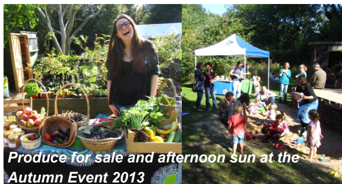
Produce for sale and afternoon sun at the Autumn Event 2013

It's been another good season for events. 'Taming of the Shrew' was terrific, despite being performed in the wake of Hurricane Bertha. Do read one audience member's amusing account of it: www.martineau-gardens.org.uk/2014/08/caps-off-for-taming-of-the-shrew/ Please do come to our final two events of the year, our Autumn Event is on Sunday 28 September and Halloween Storytelling is Friday 31 October. Thanks to a grant from the John Feeney Trust, we have refurbished the platform of the children's shipwreck play area to give it a new lease of life. Pictured overleaf, this multi-purpose platform has been used as a stage at our events (from actors to musicians) and most importantly our younger visitors have been able to return on board to 'swab the decks' and other such pirate play.