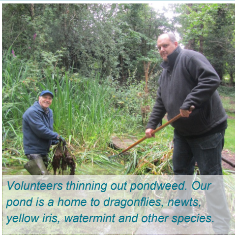
Volunteers thinning out pondweed. Our pond is a home to dragonflies, newts, yellow iris, watermint and other species.

For the fifth year running, Martineau Gardens has been awarded a Green Flag Community Award. The award recognises and rewards the best parks and green spaces across the country. This award is a tribute to the dedication of our volunteers who work hard to keep the gardens a beautiful and tranquil spot for all to come and relax in.