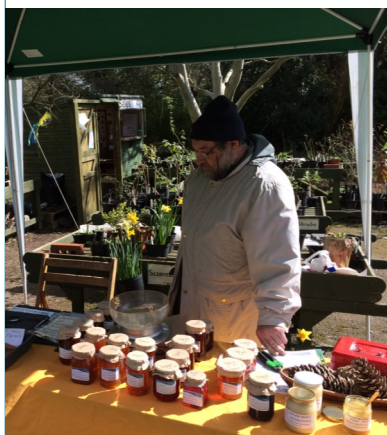
Selling honey, jams and jellies at the Big Dig event.

Every September, we sell honey made by the Martineau Gardens bees, the honey goes like 'hot cakes' and by November it's largely gone and it seems a long wait until Autumn. Good news for honey fans, we're now selling locally produced honey, made by bees living less than six miles from Martineau Gardens. Why not pop in for a jar?