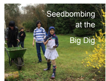
Seedbombing at the Big Dig

If you'd like to get closer to nature and find out more from the experts, book a place on our Bat Walk, in the company of BrumBats, on Wed 16 April. See http://bitly.com/1mcERPG