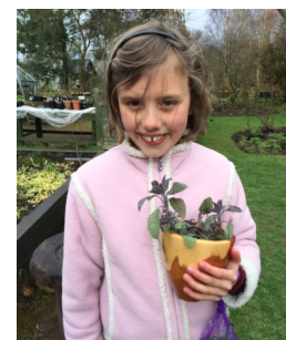
Hands fresh from seed bombing (left) and a keen gardener with her sage cutting (right)