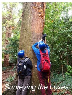
Surveying the boxes

On a bright September morning, Morgan Bowers (of BrumBats and our former Biodiversity Officer) accompanied by two trainee Bat Surveyors, came in to survey 20 bat boxes at Martineau Gardens. It was not until the final three were inspected that they found what they were looking for. To our joy, four bats were found in the most surprising of places: a box located high up on the mast of the 'shipwreck'. Bats generally prefer shaded, protected areas rather than open areas – this box was installed to raise awareness with visitors rather than a place for bats to roost. One sleeping bat was carefully lifted from the box, inspected, weighed and identified as a female Soprano pipistrelle bat. Though one of the UK's most common bats, they are a protected species and their population is in decline. We're very glad that the bats continue to find a home at Martineau Gardens, just two miles from the city centre. Our thanks to BrumBats for the survey and supplying these incredible photos. Full report plus bat facts at: http://bit.ly/HUEVSI Join BrumBats for bat walks and talks http://brumbats.wordpress.com/