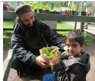
Father and son with beans harvested at our recent Honey Show.

... to Martineau Gardens, a place where city dwelling youngsters can learn about healthy eating by finding out where food comes from.