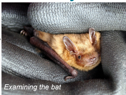
Examining the bat