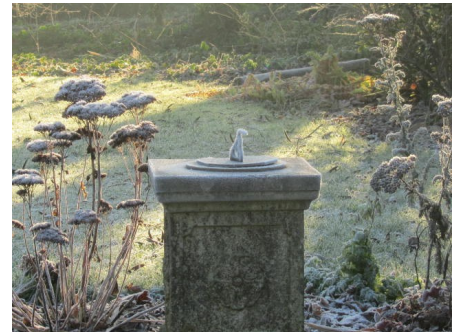
Early morning sunshine and frost on Sedum in the sundial lawn