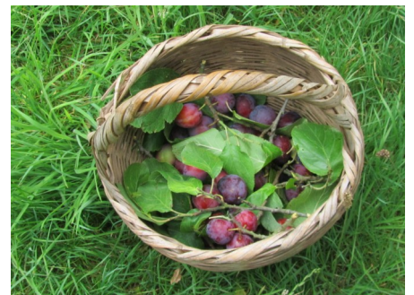
Garden's bounty - the fruits of late summer.

Full details at www.martineau-gardens.org.uk